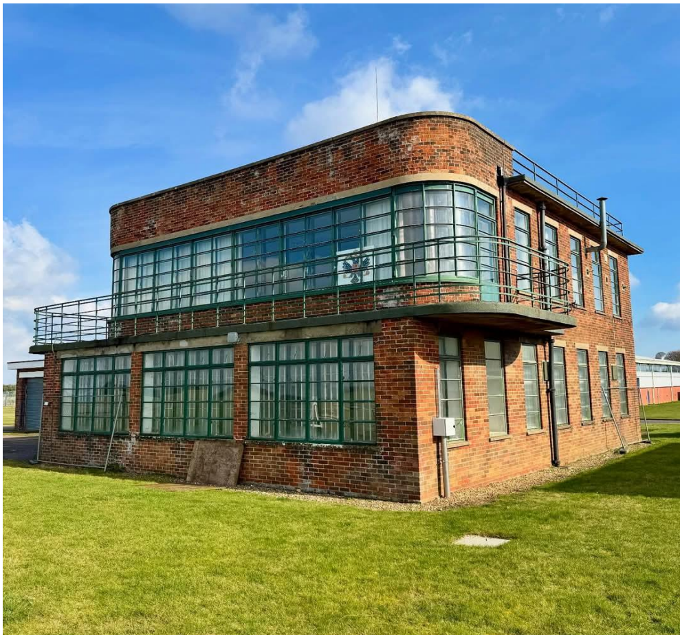
Swanton Morley Air Traffic Control Tower